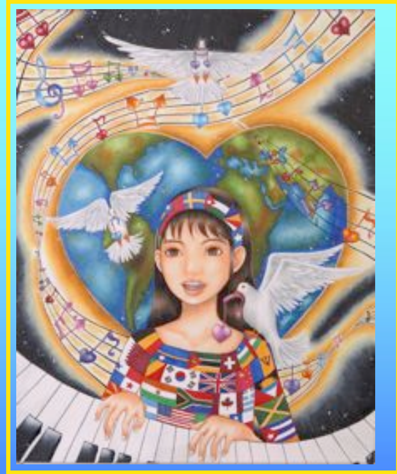
Min-Ji Yi 13 years old California, USA

My poster represents the harmony of all the countries in the world coming together as one. Just as music creates a peaceful melody, the world should be able to also."